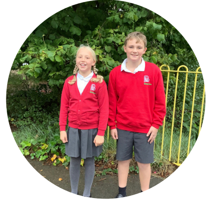
HEAD BOY / HEAD GIRL